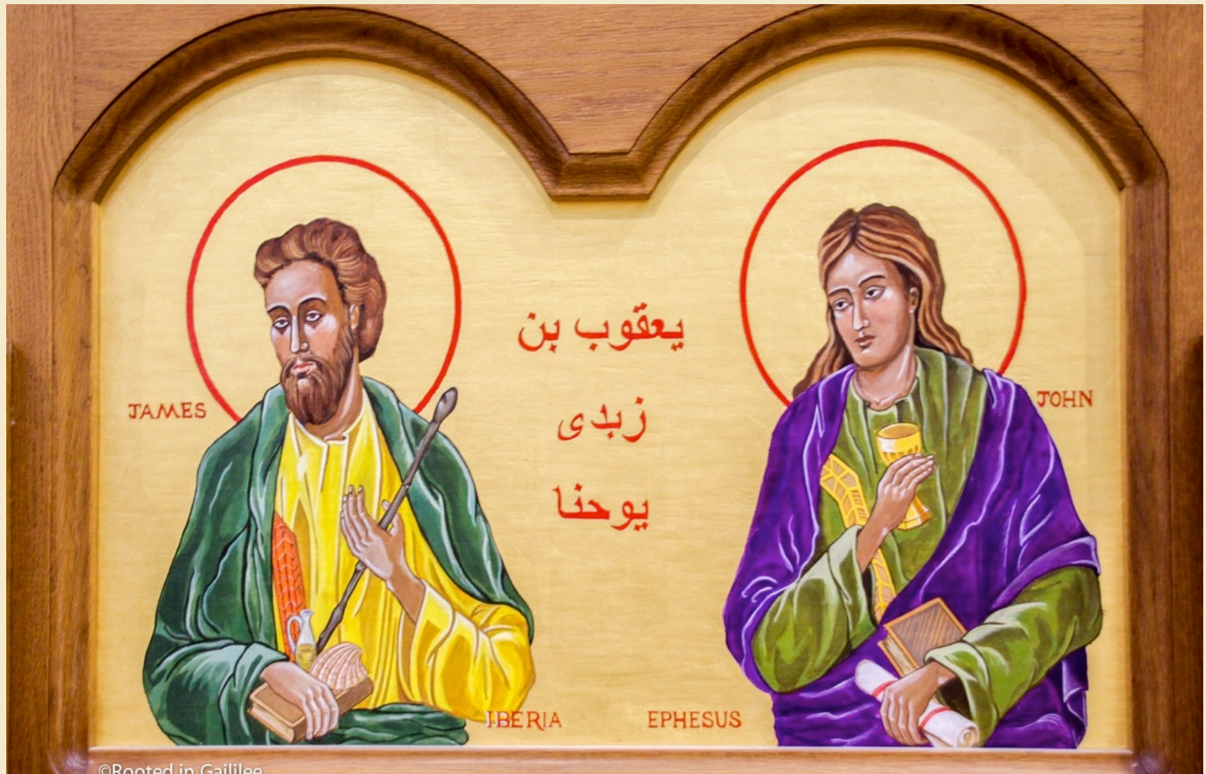
Peace from Iberia to Ephesus (James and John)