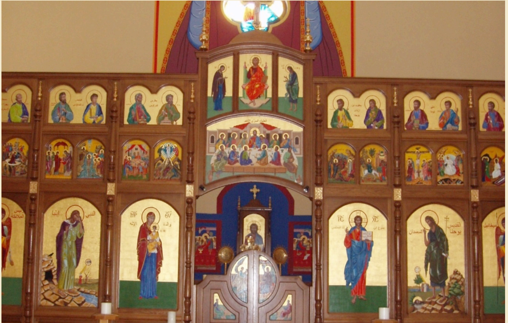
Rooted in Galilee - An Iconostasis for Peace