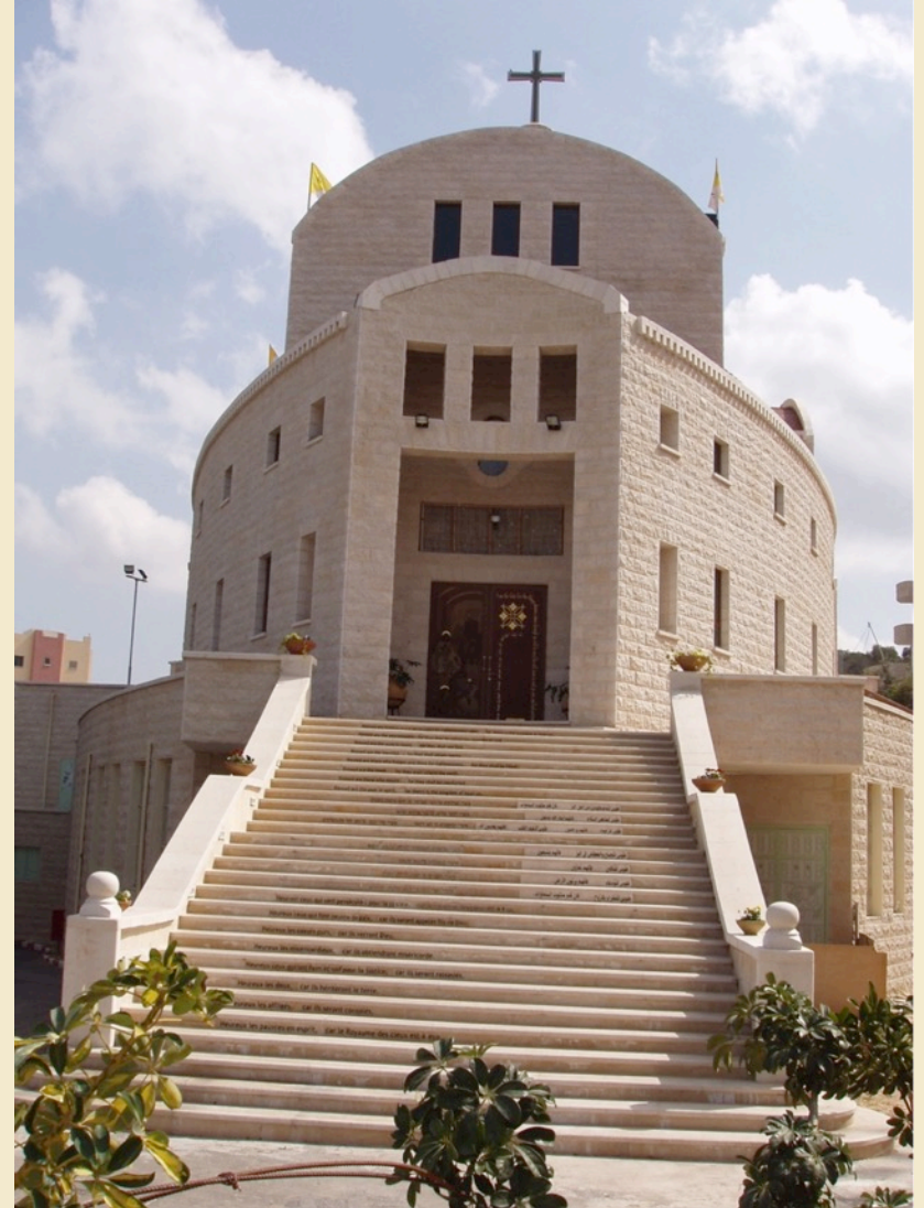
The first building on Mar Elias Campus completed in 1982, Church of the Sermon on the Mount