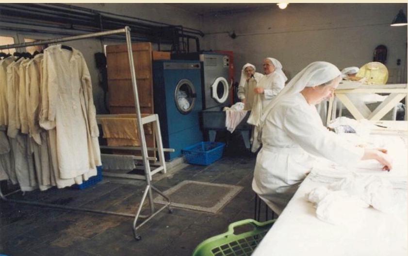
Monastery Community Life