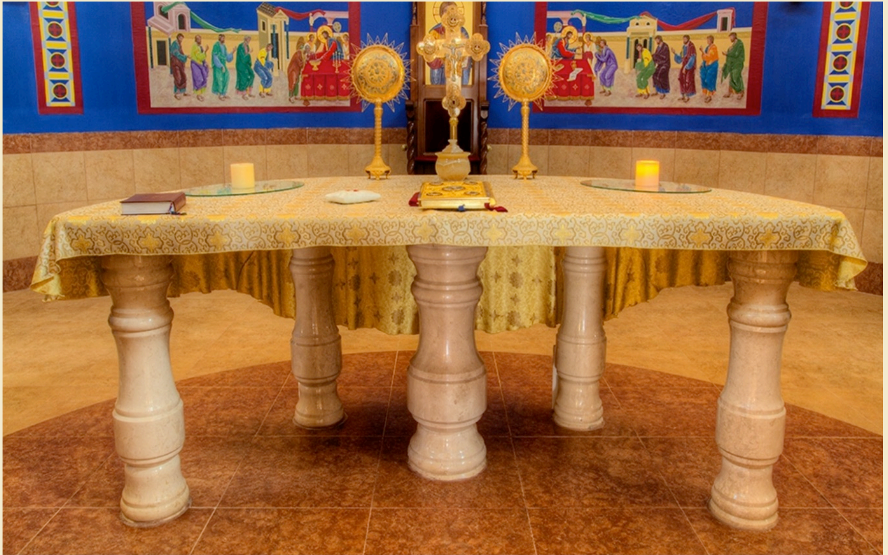
The marble altar was donated by a Muslim leader