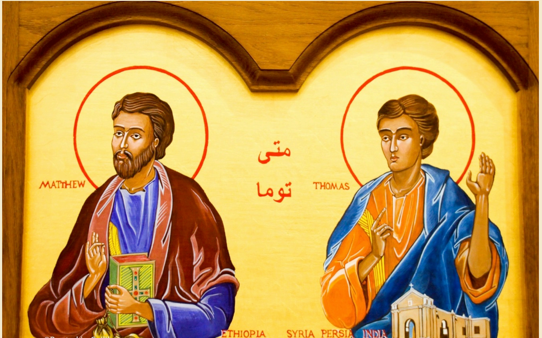
Peace from Ethiopia to Syria Persia and India (Mathew and Thomas)